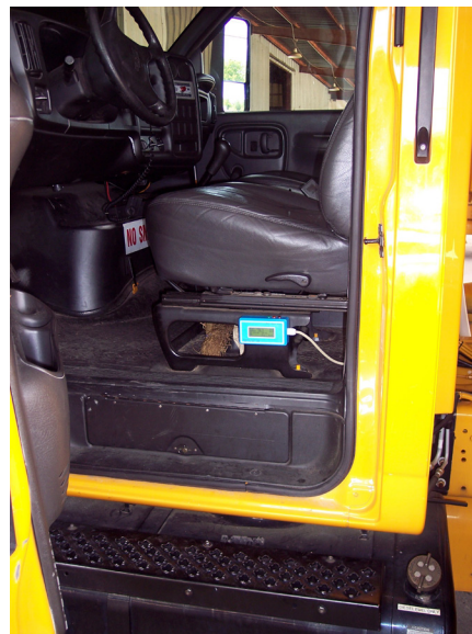
Display Mounted Eye Level on Drivers Seat

UL Listed and or equivalent approval for NEMA 4, 7 and 9. Solid state pulse transmitters with 0-5 VDC pulse train.