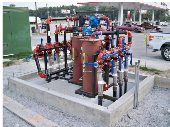
Skid and Filtration Mounted Blenders